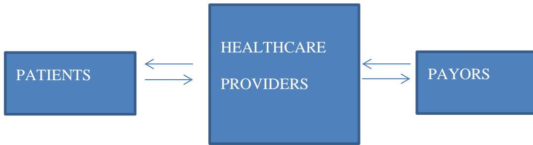
Figure 1. Healthcare Delivery System.

The graphic in Figure 1 shows the entities involved in the healthcare delivery system.